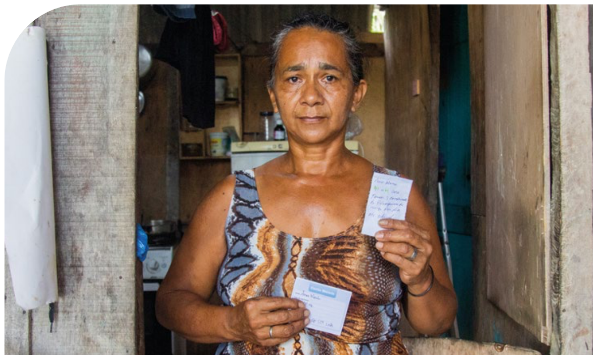
← A woman holds her Cartão Malaria and primaquine prescription (Manaus, Brazil)